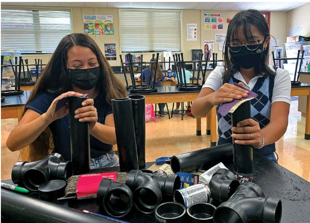
Two eighth graders from Orchard Park School in Antioch build the testing device for a MESA competition.